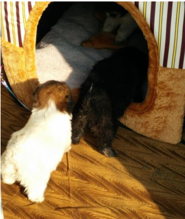
Puppies can enjoy a little sunshine in their warm houses