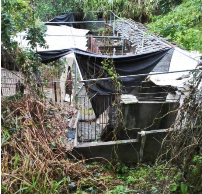
Before renovation, the roof was completely destroyed

At the end of August, the above areas were almost finished. The funding helped about 300 animals.