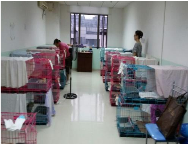
An office of a Shanghai neighborhood committee vacated a room for the operated cats to rest