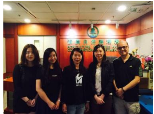
Officers of the Agriculture and Fisheries Department, Hong Kong and our staff.

In 2015 we sent out open letters to governments of Bazhong in Sichuan, Shenyang, Nanchang, Baoji, Lanzhou and Xinhua to put forward our suggestions and opinions on problems appearing in local dog management methods. Meanwhile, we handed in our suggestions for improving dog ownership management regulations to Nanchang, Changsha, Lanzhou and Zhuhai governments.