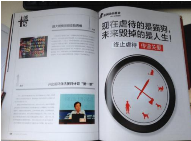
"Life Weekly of Yangzi River" published our anti animals abuse poster in their March issue