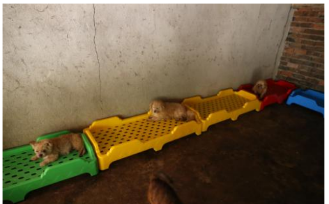
Funded Wuhan Small Animal Rescue Center with dog beds