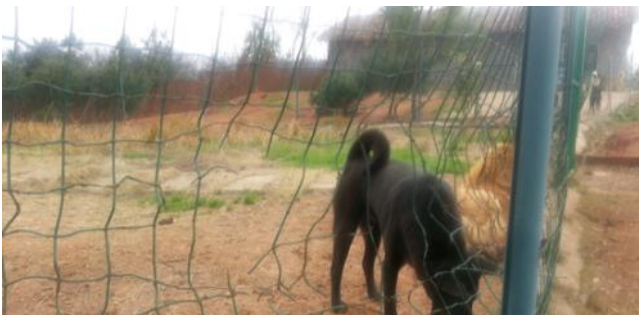
Damaged fencing in Nanchang Small Animals Association „before and after renovation