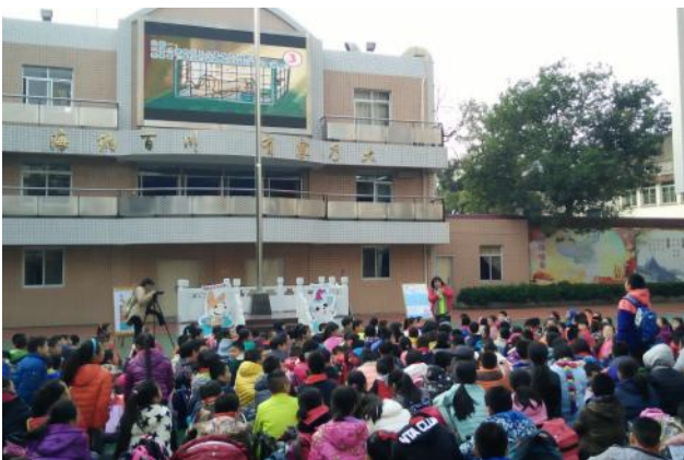
Fuzhou City Small Animals Protection Association giving a speech while playing the video in a local school

At the end of 2015, in order to publicize the ideas such as "cat and dog welfare" and "be a responsible pet owner" , Animals Asia launched a charity video " Cat and Dog Welfare Around Us " campaign across China. We invited organisations around the country to conduct large scale video watching activities, and develop related public education campaigns. At the end of December, 12 organisations had responded and the video had been viewed by over 20,000 people. We then selected four organisations that were considered outstanding according to their activity feedback, and presented them with awards.