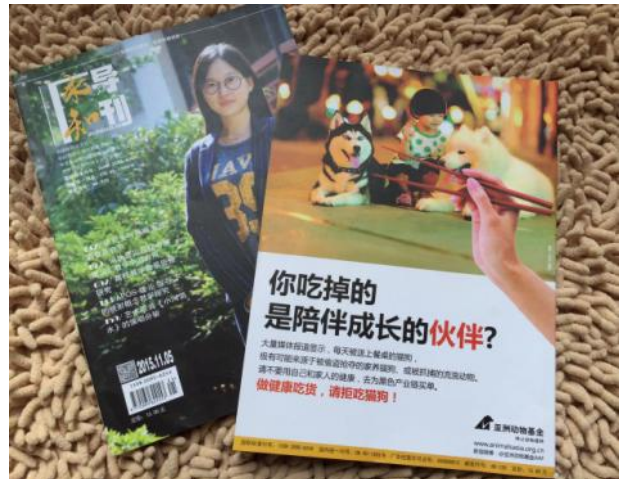
Knowledge Guide magazine published our say NO to cat and dog's meat poster on the back cover of its November issue

In April, Karen Mok's series of charity advertisements, including being a responsible owner of cats and dogs, being a healthy foodie and saying no to eating cats and dogs, and how to get along with dogs,