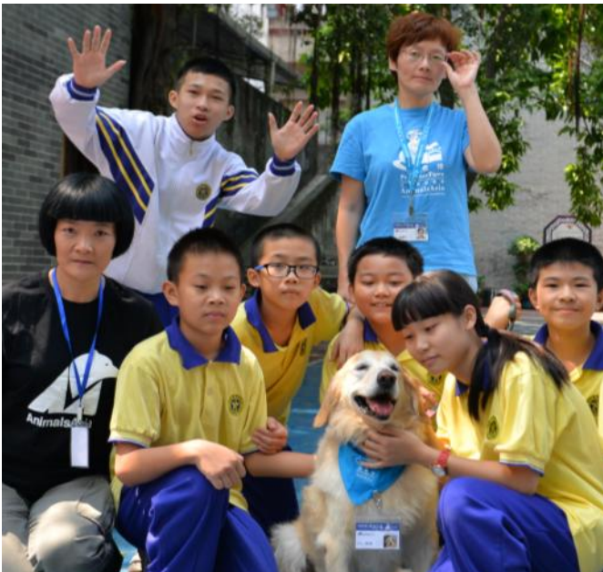
Adi as Professor Paws visited school with his owner