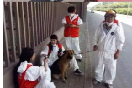
Volunteers searching through the affected area