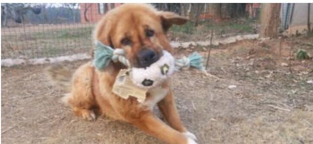
Funded toys for animals in Nanchang Small Animals Protection Association

The funded items included: renovation of shelters, clippers, beds, toys, dog food, vaccination, deworming tablets, anti-pest sprays and collars. Over 7,300 animals benefited.