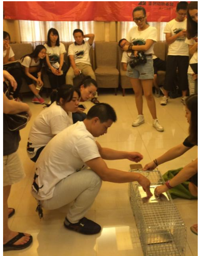
Volunteers get to practice with trapping cages after the speech