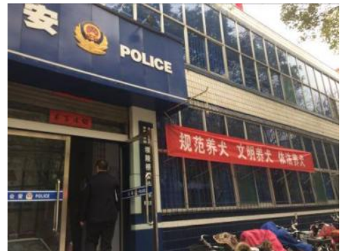
a "civilized dog keeping" banner outside the Taiyuan city PSB

In 2015, staff of the China Cat and Dog Welfare team visited local dog management departments in 15 cities such as Jinan, Beijing, Shi Jiazhuang, Taiyuan, Chongqing, Nanchang, Xiamen, Lanzhou and Hong Kong. We communicated with the officers and visited the animal shelters. During the visits and interviews, we learnt of the practical measurements they took towards dog management methods, and the difficulties they met. Through this, we adapt the outstanding methods and recommend them to other cities. It is also helpful for us to give more down to earth suggestions to other