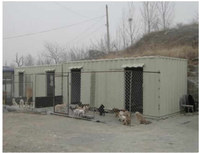
The new houses completed