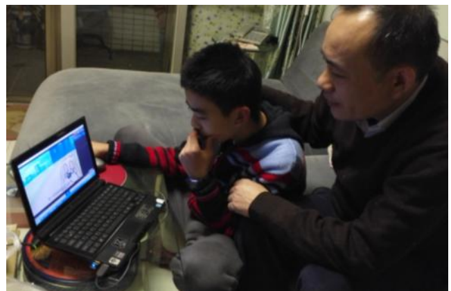
A student from Guangzhou Juxian Middle School is watching the video with his father at home