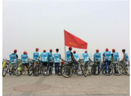
Cycling campaign of Nanchang Small Animals Protection Group