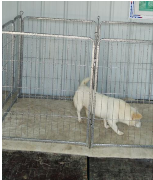
Cotton pads are provided inside the houses