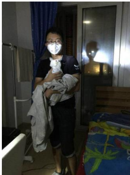
A volunteer found a lost cat in an empty apartment

In the major port city of Tianjin in north east China, a series of chemical explosions led to uncontrollable fires that left 165 people dead and 8 people missing, causing widespread panic. In the rush to evacuate the area this disaster occurred in, many pets were left behind. While the human cost and scale of the tragedy made worldwide headlines, the animal victims went largely unreported.