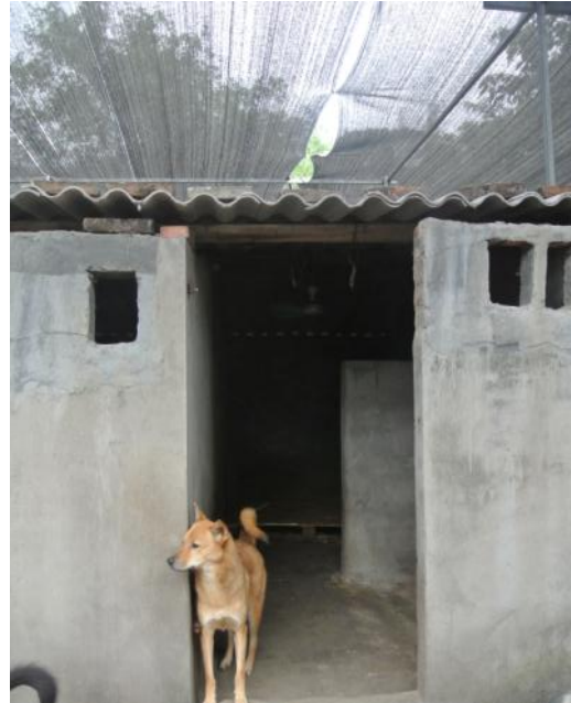
After renovation, the roof is safe again