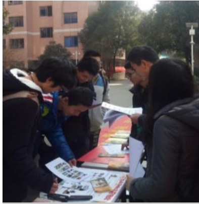
Volunteers of Hunan University conducting "Caring for Small Animals" campus campaign, using our leaflets

In 2015, Animals Asia distributed 24,509 leaflets, 962 posters and 66 DVDs to animal protection associations in 28 cities. We supported over 30 public education activities with free materials.