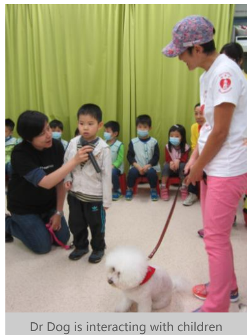
Dr Dog is interacting with children