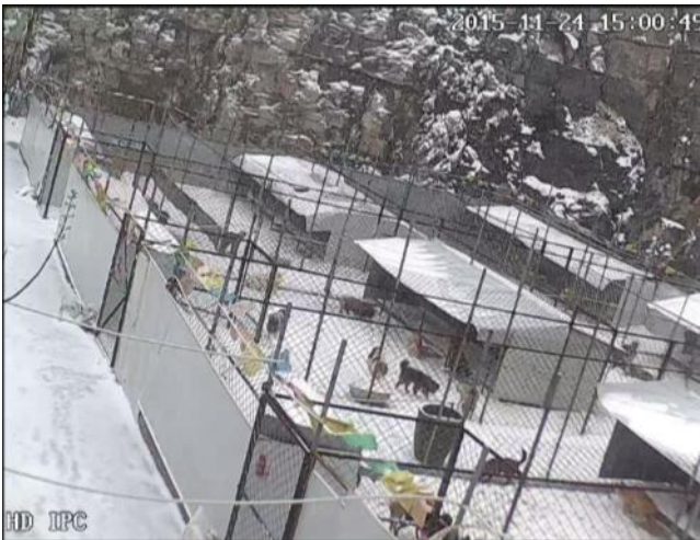
The old doghouses had large open area