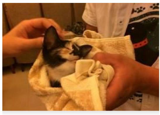
A kitten was found in a trash cart

The TNR training gives an opportunity to the local volunteers to have a comprehensive discussion with