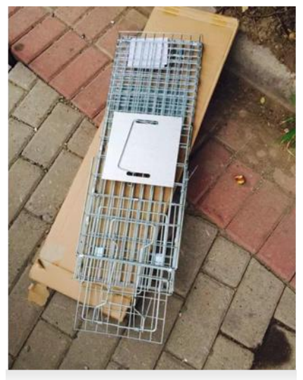
The trapping cages we offered

12<sup>th</sup> August, a serious explosion occurred in the Bin Hai New District of Tian Jin City. The accident was so sudden that many residents left their pets behind during evacuation. We contacted two local animal rescue organisations for help, and offered 10 cat trapping cages and the guidebook "Operation of Large Scale Animal Rescue", edited by Animals Asia. The two organisations searched through the area and helped the animals they saved to find their owners. In the rescue, a combination of about 60 cats and dogs were saved and returned.