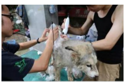
Dogs having hair trim