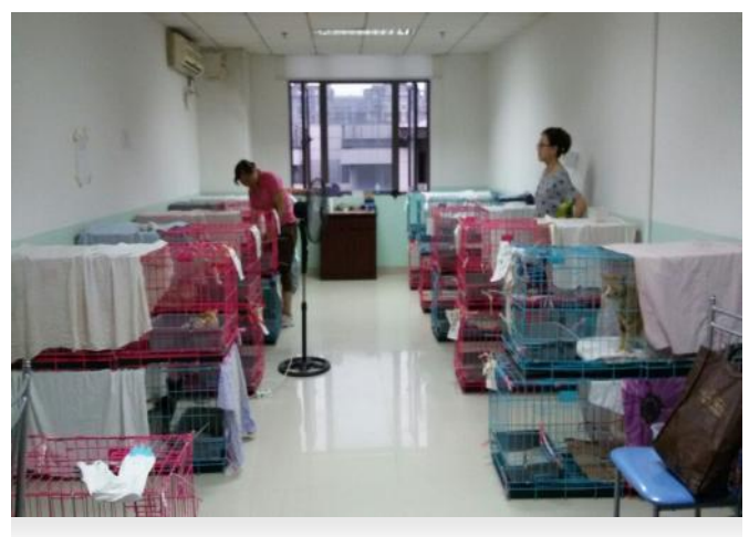
a vacated office for keeping cats after surgery