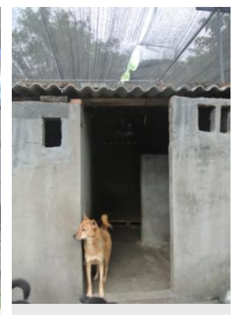
The top of the shelter is now fixed