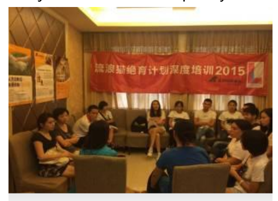
Volunteers are having a discussion

unteers can join the team and help stray animals.