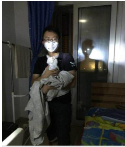
A cat was found trapped in an apartment