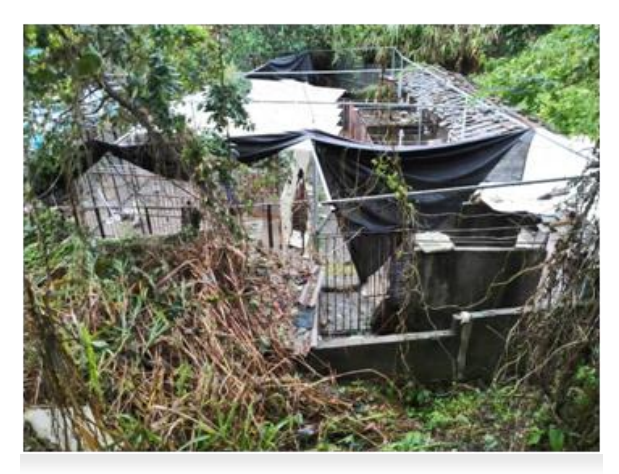
The top of the shelter was seriously destroyed