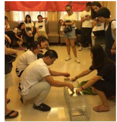
Volunteers are using trapping cages