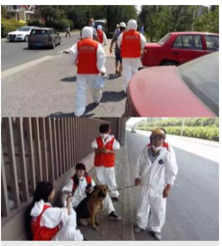
Volunteers search the exploded area