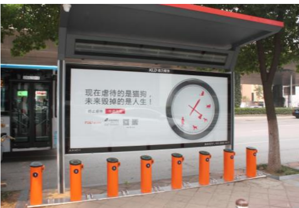
Animals Asia "Stop Abuse, Pass on Love" advertisement