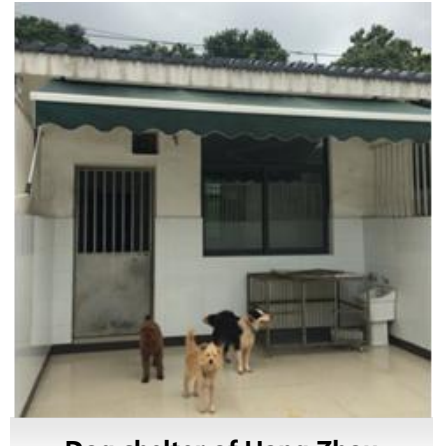
Dog shelter of Hang Zhou Canine Adoption Centre

On 23rd July, we visited the Hang Zhou City Management Committee to discuss the working model and development of dog management. The Hang Zhou Canine Association has just been established and will take over the issuing of dog adoption permits. After the meeting, we visited the Hang Zhou Canine Adoption Centre. The centre is well-planned, has a strict control over the number of dogs, and conducts regular adoption and open day visits.