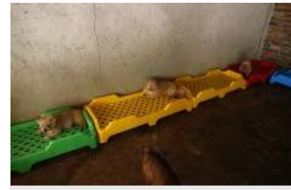
New beds are ventilate